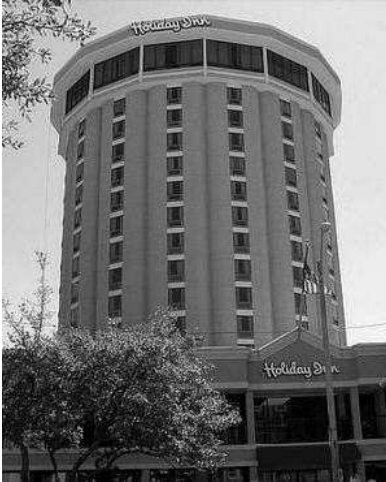
The Holiday Inn In Historic Downtown Mobile, AL