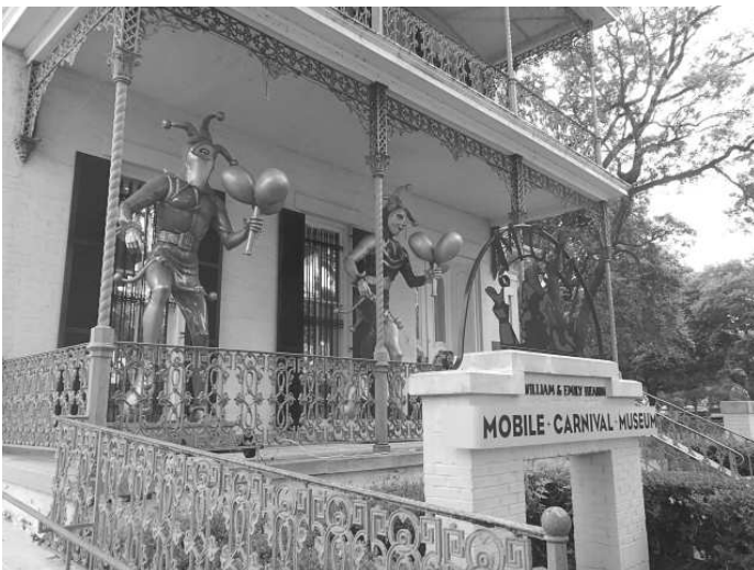
The Mobile Carnival (Mardi Gras) Museum Located Next Door To The Holiday Inn