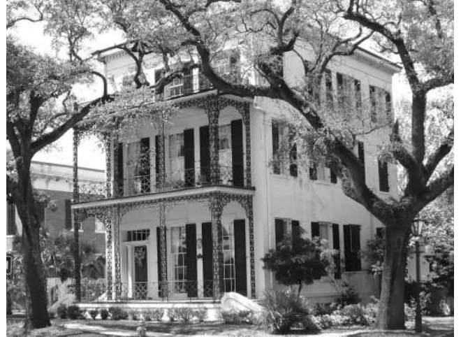
One Of The Many Historic Houses On Our City Tour