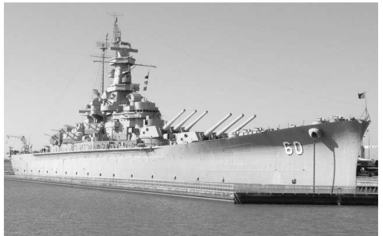
The USS Alabama (BB-60) Battleship Memorial Park Where We Had Lunch And Visited Its Many Exhibits