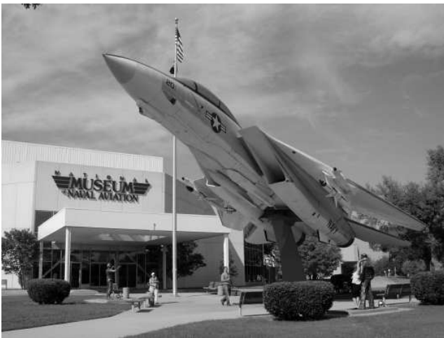
We Visited The National Museum Of Naval Aviation In Pensacola, FL